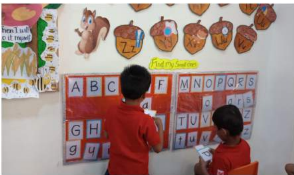
ACTIVITY BESED LEARNING