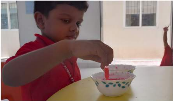
WATER TRANSFER USING FILLER