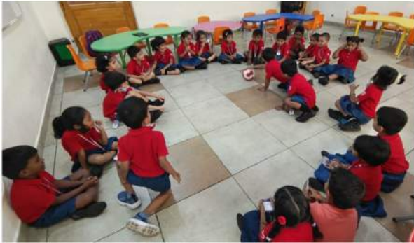
IT,S HOPPING TIME