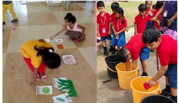
VEGETABLE SORTING WASH&SQUEESE